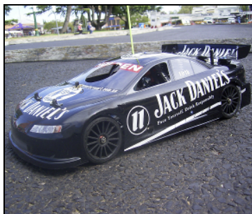
One of the V8 Themed Bodies

It was a very early start to the day for organisers with all equipment needing to be transported and set up to create an RC track in the middle of Church St, Bathurst. A big thank you must go to everyone involved who worked extremely hard to get the equipment set up and packed up – especially drivers from outside PDNR!