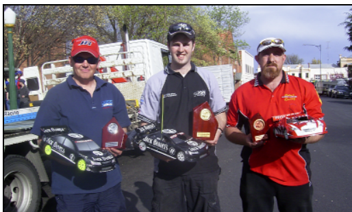
The Podium of the 2007 RC Bathurst 1000

The next instalment of Racing Around Town focuses on the 2007 RC Bathurst 1000. The RC Bathurst 1000 is another keystone event for PDNR, and organisers were very pleased when confirmation came through that this event would return to the country town of Bathurst as part of the V8 Street Party. Unfortunately an 11 th hour approval didn't leave much time to properly promote the event and so the attendance was smaller than expected, but that didn't stop the drivers putting on a great show for the massive crowds.