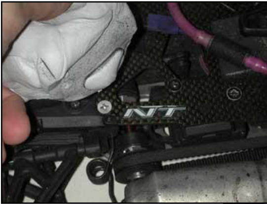
Left: You can see the debris picked up by the putty.

Cleaning gum is extremely handy for cleaning dirt and tyre dust from your car. I usually blow the chassis down first to remove the bulk of the mess, and then the cleaning gum is used to get any tricky spots that are left. It’s extremely good for shock bodies and springs, pulleys, clutches and the engine/carburetor. It can also be used to seal receiver boxes, wiring, leads and switches from fuel and debris.