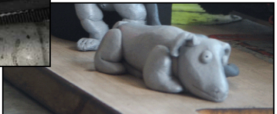
Right: Another use of power putty is filling in time during rain delays!.

The cleaning gum is designed not to stick to the car, and you can push it into the smallest places and tightest corners to do its cleaning job. Try it and before you know it, you’ll wonder how you could ever do without it!