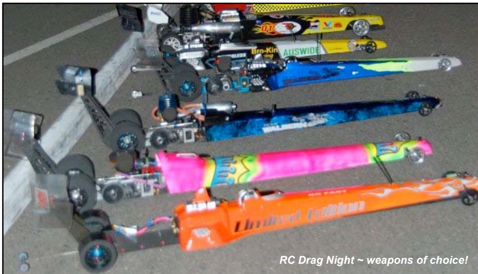
RC Drag Night ~ weapons of choice!

The PDNR Drag Racing Section had it's most successful year ever in 2009. Everything to do with the RC Drag Racing Section was the best it's ever been. There were more events, more records, record numbers of entrants, and the speeds and standards get better every race meeting. 2009 also saw the inaugural RC Drag Racing National Championships hosted by QMDRA in Queensland. A few PDNR drag racers made the trip across the border and did PDNR very proud – and went faster than they have ever gone before!