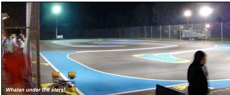
Whalan under the stars!