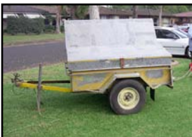
2002 PDNR Trailer...

All the past racers I have spoken with are amazed at how PDNR have grown. They comment on the many great improvements that have been made to track equipment and the RC vehicles themselves, along with the professional level of organisation that PDNR now deliver to racers.