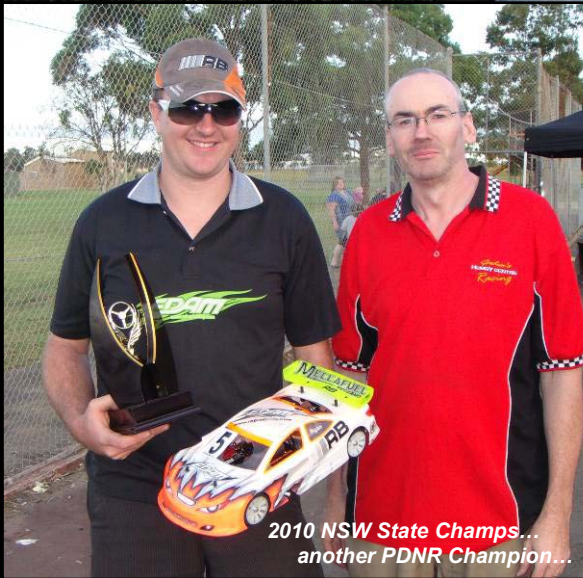
2010 NSW State Champs... another PDNR Champion...