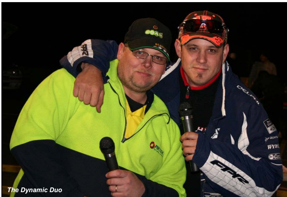
The Dynamic Duo

Hope to see you all at the next round of Drag Racing.