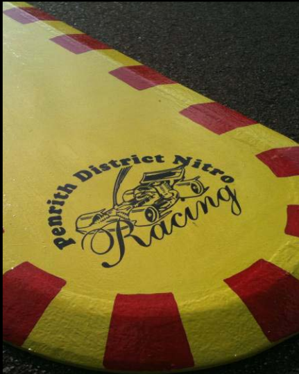
New track upgrades...

THE NEWSLETTER OF PENRITH DISTRICT NITRO RACING INC. (PDNR)