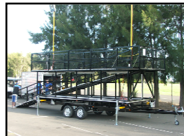
2010 PDNR Trailer...