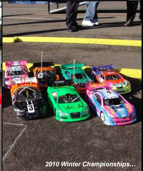
2010 Winter Championships...